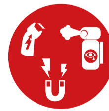
Miscellaneous Dangerous Goods