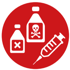
Toxic and Infectious Substances