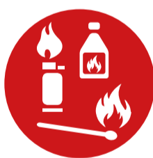
Flammable Liquids and Flammable Solids